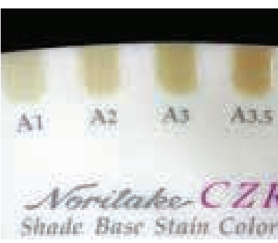
Shade Base Stain Color Guide