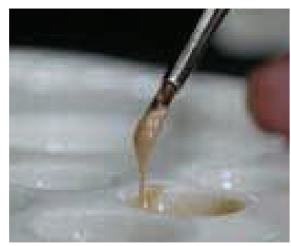
Mix the shade base stain with IS liquid