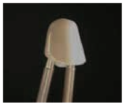
Thick Application of Shade Base Stain