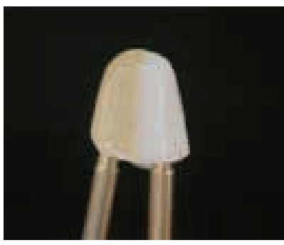
Thin Application of Shade Base Stain